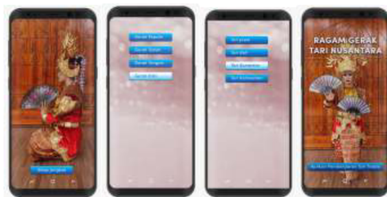
Figure 2. Design of Android-based dance learning application

In Figure 2, the appearance of an Android-based dance learning application, started with the face or cover displaying with the title of the material to be studied, then there is a button that must be pressed that will then display the next slide. There are several choices, namely dance from various regions, and when pressed one of the dances the next page will display gestures then choose which parts to learn. Simple design of Android-based traditional dance motion learning media, then it will be developed.