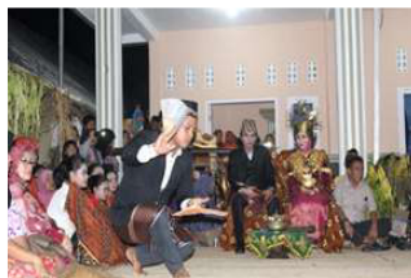
Figure 2a. The usage of sekapur sirih in customary deliberation (Daryanti, 2018).

mainly using Malay customary. Sirih pinang or Sekapur Sirih was used as a traditional means of the wedding ceremony. The use of Sirih pinang was not intended for betel-munching, but only as a customary mean as a symbol. Sirih pinang was used as a symbol that contained meaning for the community as a form of acceptance and respect. Some research on the use of sirih pinang in marriage ceremonies as a symbol of sirih pinang as a means of non-verbal communication in the habit of persuasion and engagement, to gain certainty. Sirih pinang has a deep meaning for society, the use of areca nut in any traditional ceremony, especially on the nyambai event was used as a symbol. Sirih pinang was an instrument of unisex a kinship. The following values are contained in the symbol of areca nut which can be implemented in daily life especially to build character in the young generation.