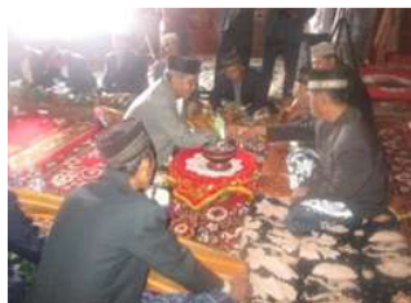
Figure 2b. The usage of Sekapur sirih in customary deliberation (Daryanti, 2018).