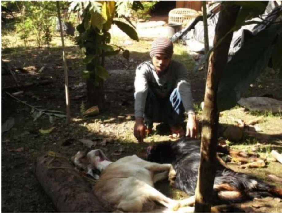
Figure 2. Goat's slaughtering