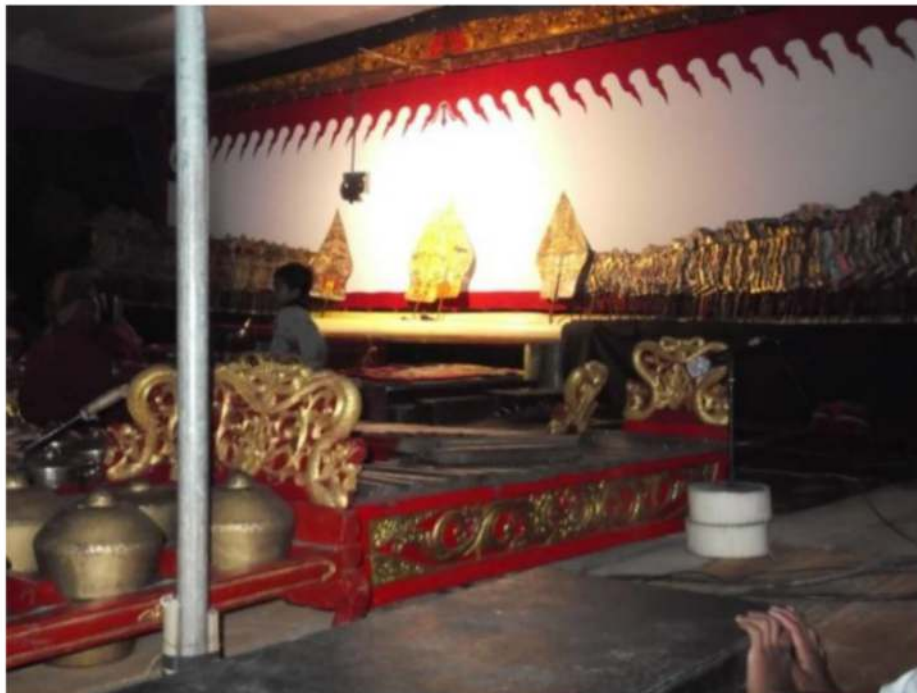
Figure 3. Puppet Performance in Bangunharjo's Hamlet Rys. 3. Przedstawienie lalek w Hamlet Bangunharjo

Puppet performance is always done as the closing event in Suroan tradition. The performance is started on the night after riungan with accompaniment of Javanese songs and gamelan. Puppet is chosen as the closing performance because it is one of the cultures that often staged in Indonesian culture.