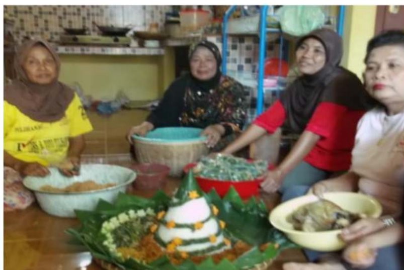
Figure 5. The women while cooking in Suroan tradition

The women are also supporting the Suroan by helping each other in cooking the food and beverages for riungan (gathering event). The cooking process is usually conducted in the hamlet by the head mother, community leader of Dusun Bangunharjo. The activity of the women begins by going to the market to buy cooking ingredients and the evening before the event the cooking activity starts until it is finished.