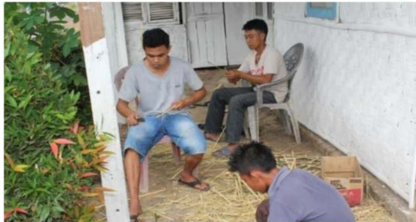
Figure 4. The society of Bangunharjo is helping each other in Suroan preparation

Besides material action, the society is also helping for the sake of Suroan successful. The society is helping start from pre-implementation including the making of stage, preparation, and cleaning the venue.