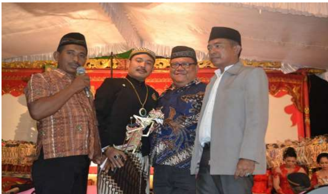
Figure 2 The Lampungese candidate for regent, posing beside Javanese shadow puppets during his political campaign 65

campaigns and the holding of cultural and Javanese shadow puppet events are just some of the ways by which the Lampungese elite can stay close to the majority Javanese voters. One Lampungese candidate pointedly remarked, “You are asking me why I am speaking in Javanese and using a [Javanese] cultural approach? Indeed, this is based on the reality that they are in the majority and, politically, I want to win their hearts” (see Error! Reference source not found. ). 64 It can thus be presumed that the application of Javanese culture is another pragmatic strategy deployed by the Lampungese elite to obtain the sympathy of Javanese voters.