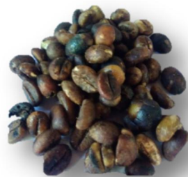
Figure 1. Coffee beans

Gally organic coffee is organic coffee that all processes from the beginning such as pre-planting to post-harvest use ghally organic technology. Gally organic coffee is the best coffee from ghally products because this coffee uses 100% organic ingredients that utilize ghally compounds to make coffee one of the best organic coffees in Lampung. Coffee "Ghalkoff" only uses 100% Lampung Fine Robusta coffee beans from plantations in West Lampung. This coffee uses fermentation technology, namely by using microorganism enzymes that can improve the quality of coffee. The coffee beans used as the main raw material for Ghalkoff coffee are coffee beans whose skin color is red or is said to be red pick. It is hoped that by using super quality coffee beans (Figure 1.) or red picks, quality coffee beans are obtained.