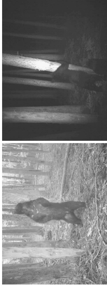
Figure 2. Camera trap photographs of an Asian black bear rubbing a Larix kaempferi tree in a conifer plantation. The left photograph (adult male) was taken in late August 2011, and the right photograph (adult female with one cub) was taken in late September 2011, both at the same tree.

the remaining visits were all by solitary bears. At 13 of these visits, the bears were identified as adult males (one in June, three in July, four in August, three in September, and two in October), and at the remaining seven visits, the bears were adults of undetermined sex (two in May, one in June, two in July, one in August, and one in September) (table 1). In the 22 visits, three bears were identified as having visited multiple times (13 visits) (table 2). During the total of three years, at least six identified different individuals rubbed, including the female with a young cub.