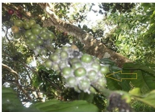
Fig. 1. Coffee berries infested by mealybug ( Planococcus citri , Risso) from which test insects were collected

The insects tested in this study were mealybug ( Planococcus citri Risso) that found to infest coffee berries ( Coffea robusta L.) in the traditional-smallholder coffee plantations of the Pekurun Village, sub-district of Abung Pekurun, the district of Lampung Utara, Lampung Province, Indonesia. The insects along with coffee berries infested (Fig. 1) were transferred to the laboratory and reared until reaching adult stages. The adult females, the developmental stage of mealybug feeding on coffee berries [19], were chosen as the test animal in this study.