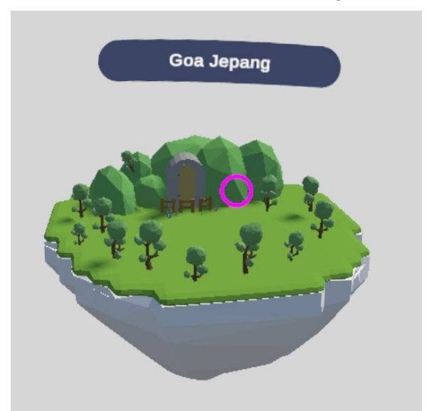
Fig. 7. Japanese Cave 3D Model

The Japanese Cave model created using Blender is used as a heritage object in one of the predetermined locations, there are several trees, fences, and the Japanese cave itself under the mountains. 3D modeling used is low poly where poly mesh / a combination of several polygons are united, this low poly 3D modeling design is not too detailed and looks minimalist. The results can be seen in Fig. 7.