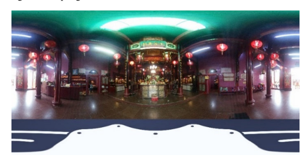
Fig. 12. Thay Hin Bio Vihara