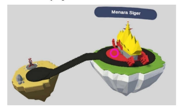
Fig. 10. Menara Siger dan 0 KM Lampung 3D Model

several polygons is united, this low poly 3D modeling design is not too detailed and looks minimalist. The Siger Tower model which has been combined with the 0 KM Lampung model can be seen in Fig. 10. The Siger Tower and 0 KM Lampung 3D model.