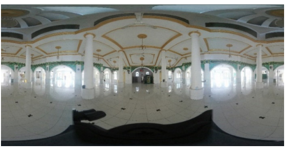
Fig. 13. Al-Anwar Mosque