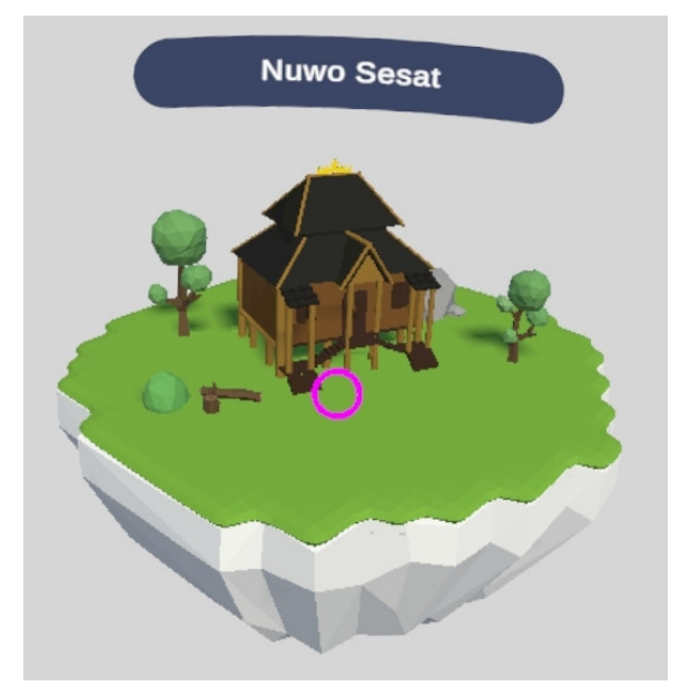
Fig. 8. Nuwo Sesat Traditional House 3D Model

The Nuwo Sesat model was created using the Blender software. 3D modeling used is low poly where the poly mesh is a combination of several polygons that unite, this low poly 3D modeling design is not too detailed and looks minimalist. The results can be seen in Fig. 8. 3D Model of Nuwo Sesat.