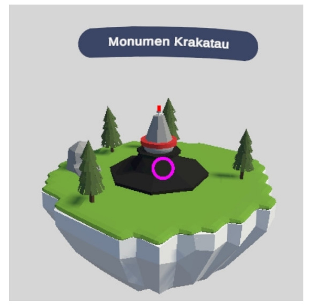
Fig. 9. Krakatoa Monument 3D Model

The Krakatoa monument was created using the Blender software. 3D modeling used is low poly where poly mesh / a combination of several polygons are united, this low poly 3D modeling design is not too detailed and looks minimalist. The results can be seen in Fig. 9. 3D Model of the Krakatoa Monument.