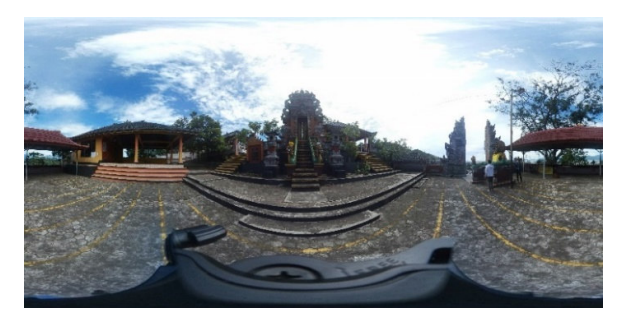
Fig. 14. Pura Kerthi Buana Temple