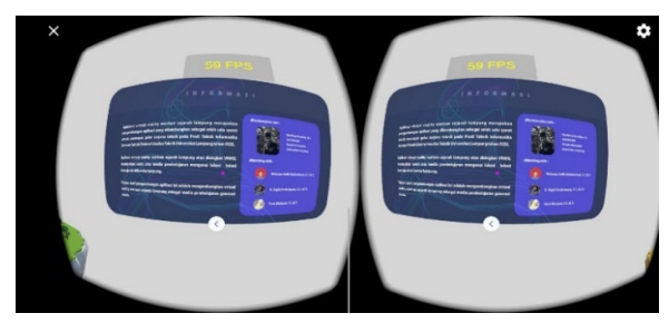
Fig. 5. Implementation of the VRWSL Information Menu

The Information menu provides information related to a brief description of the application and the application development team. The results of the Information Menu implementation can be seen in Fig. 5.