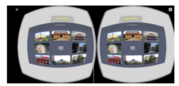
Fig. 6. Implementation of the VRWSL Location Menu