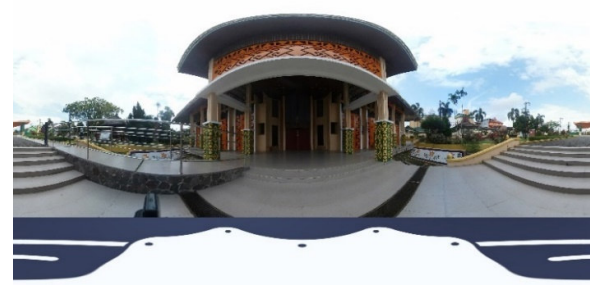
Fig. 11. Lampung Museum

The creation of this 360 panoramic image is by predetermined locations. Panoramic 360 images were taken using a Samsung Gear 360. The shooting locations consisted of the Lampung Museum (Fig. 11), Thay Hin Bio Vihara (Fig. 12), Al-Anwar Mosque (Fig. 13), and Kerti Bhuana Temple (Fig. 14).