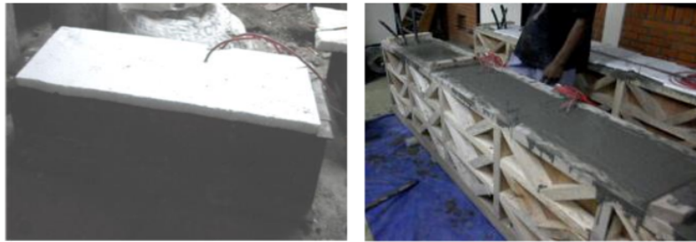
Figure 2. Styrofoam covers the specimens for one day

In this research, shrinkage was measured as strain change against time by installing one EVWSG in each beam and column specimen, and four EVWSGs in a full-scale specimen and plate (Figures 1a and 1b). The EVWSG was able to detect the strain up to 3000 µε with an accuracy of about .025% and concrete temperature between -80oC and 60oC with about .5% accuracy. Right after casting, specimens were covered with styrofoam to eliminate water evaporation (Figure 2). The observation was performed right after pouring every 15 minutes until 24 hours using a readout.