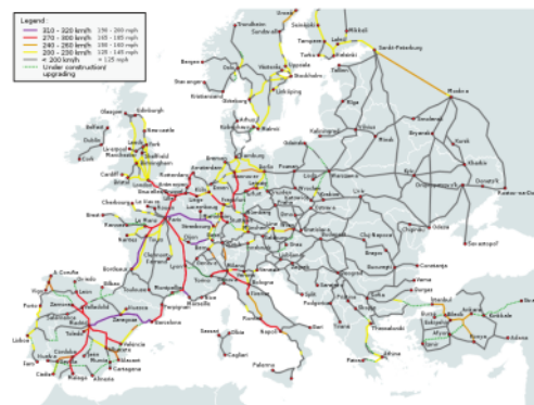
FIGURE 2. European network of high-speed rail system

Fig. 2 presents the HSR services network throughout Europe. UK is now closer to building HSR infrastructure but until now they have been reluctant to give the definitive approval, and the money allocated to HSR has not gone beyond financing the cost of the evaluation of its economic and financial viability. Other countries, like France and Spain, have been keener on HSR than other European countries like Norway or Sweden, for example, whose governments are still studying whether this type of investment is socially worthy. Spain is a unique case because, with much less traffic density than other countries (and much less congestion) in the conventional rail network, it is going to very soon be one of the first countries in the world measured in HSR kilometers. HSR has since remained firmly on the European rail agenda and has led to an expansive HSR network, together with plans to grow the network from under 10,000 kilometers in 2008, to 22,000 kilometers by 2020, and in excess of 30,000 kilometers by 2030 [15].