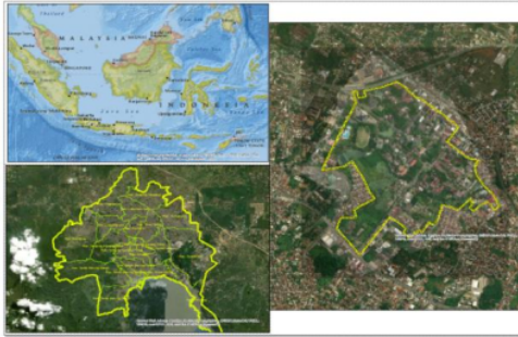
Fig. 2. Research Site.

Analyze and calibrate water level elevation data using HEC-RAS. After performing the analysis using the HEC-RAS program, the water level elevation was obtained in the output HEC-RAS file. However, the results of these outputs are not necessarily accurate or certain with these results. Therefore, a calibration step is needed by comparing the data in the field with the HEC-RAS simulation. This is done to prove the Manning number (n) obtained from the calculation is appropriate or not.