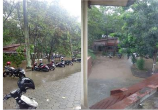
Fig. 3. Flood Points D13, D12, D15 and D16.

areas. Runoff occurs in sections D12 and D13 with a water level of 33 cm and 22 cm overflow over 55 m. The new drainage section plans are at points D13 to D12 along 100 m and D15 to D16 along 100 m. Table I is the evaluation result of the cross section which determines whether the flow in the study location has overflowed or not.