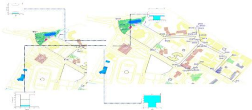
Fig. 4. Water Face Profile at Cross Section DN 12 and DN 13, DN 15 and DN 16.