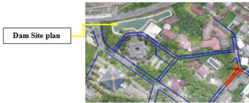
Fig. 5. Drainage System and Embung Construction Location Plan.