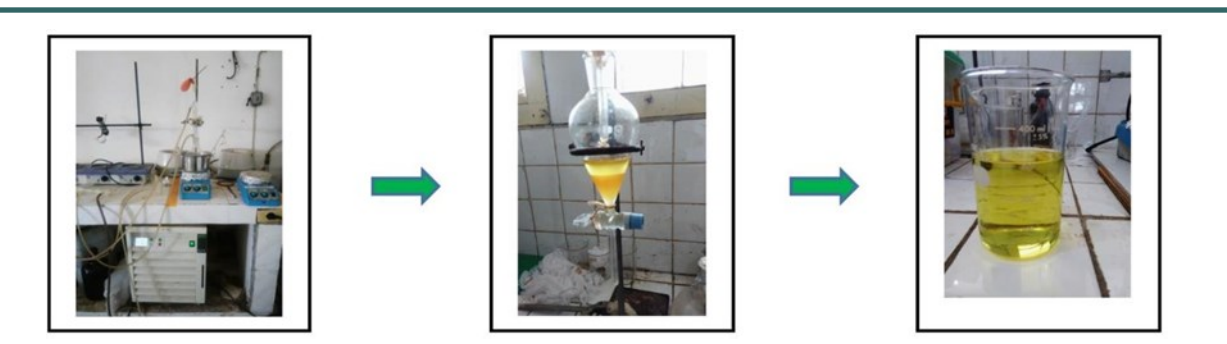
Figure 2. Preparation scheme of biodiesel made from waste cooking oil using CaO heterogeneous catalyst.

A certain amount of water was then added into the biodiesel mixture for a purification purpose. The crude biodiesel was washed repeatedly until the aqueous phase no longer contained soap and appeared as a clear solution. Finally, the biodiesel was heated at 60 ^{0} C for 10 min to evaporate the water which maystill be left.