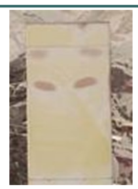
Figure 3. Rf values of methyl ester produced.