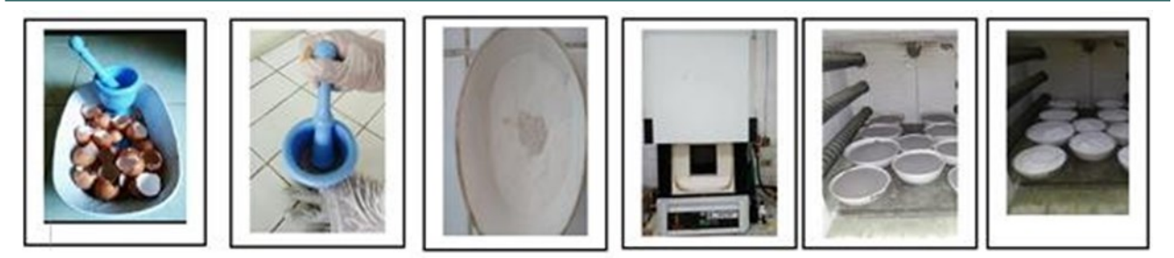
Figure 1. The synthesis scheme of CaO heterogeneous catalysts from pure breed chicken eggshells.

used WCC with a dose of 6% to convert cooking oil waste in 82% biodiesel yield [17]. Alptekin et al. conducted a reduction of FFA content using acid catalysts and then produced biodiesel using alkaline catalysts [18]. Dang et al. convert WCO from canteen source to biodiesel [19]. Xiong et al. convert alcohol made from used cooking oil waste into biodiesel [20]. Marchetti conducted a study on the comparison of biodiesel products produced using raw materials for new cooking oil and used cooking oil, the results obtained were 40% of biodiesel products [21]. Agarwal et al. produced biodiesel by converting used cooking oil into biodiesel using a KOH catalyst in 98.2% yield [22]. Considering some of the aspects described above, the study aims to produce biodiesel from used cooking oil waste taking into account the advantages offered by the heterogeneous catalyst CaO made from pure breed chicken eggshells.