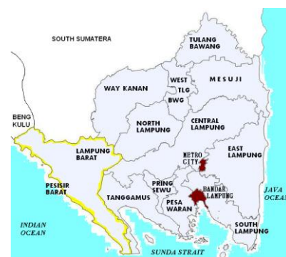
Fig. 2: Administrative divisions of Lampung Province, Indonesia

They participated in a student community service program in rural areas in five regencies, including Tanggamus, Pringsewu, Pesawaran, South Lampung, and Central Lampung, with 50 of them taking part in January 2020 and 100 in July 2020. In the five regencies, this study was done through intensive contact with participants under investigation in a natural context, with key informants purposefully invited to take part in this study. Below is the map showing the administrative divisions of the Lampung province where the participants conducted their community service.