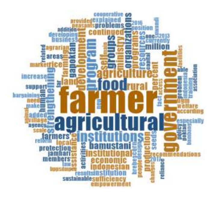
Figure 2. Word Cloud Analysis of Online News

that farmer can be more independent to do some activities in farmer institution. The result of word cloud analysis can be seen on Figure 2 as follows: