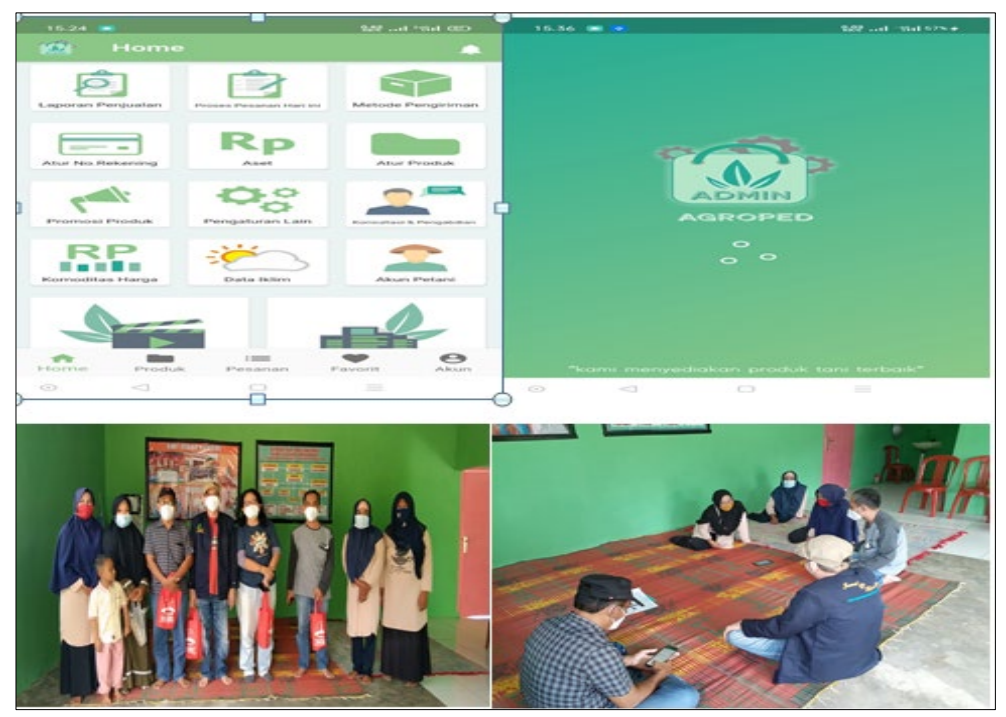
Fig. 3. AGROPED face and socialisation internet aplications for farmers' group

It was unpredictable that the pandemic was uncertainly continued, that all field works were canceled. During this passive time, the idea of developing simple startup was considered and came out with AGROPED. AGROPED developed to help farmers to sell and buy agriculture product and needs; however, AGROPED is not only for commercial but also functioned for consultations and for getting information. Recently, visiting field was possible, with following the health regulations strictly; next step to socialize AGROPED to farmers group is planned.