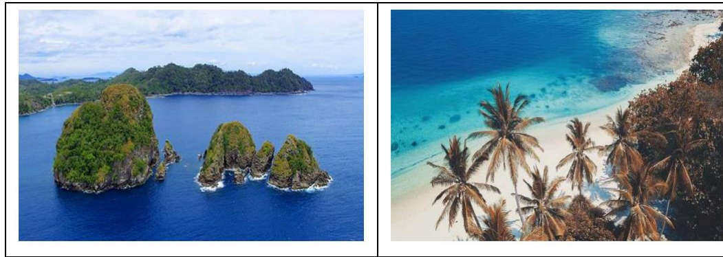
Figure 1. Pulau Wayang and Teluk Hantu – Pesawarn District of Lampung Province

Therefore, this study was conducted to determine any suitable strategy for development of sustainable community based marine ecotourism.