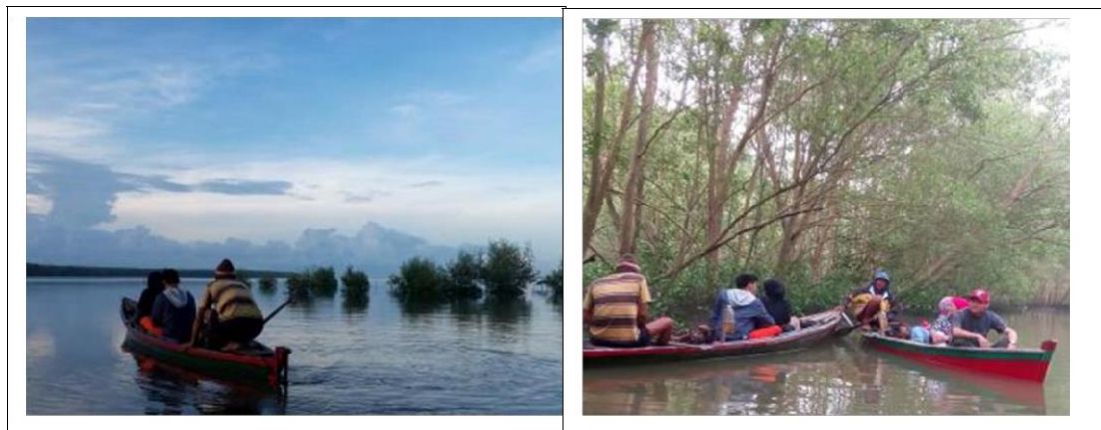
Figure 3. Typical shallow water of Lampung Mangrove Center of Margasari Village

opportunities for the locals [12]. Therefore, empowering the locals, especially for local women would give great benefit for both the ecosystem itself as well as the managing mangrove ecotourism.