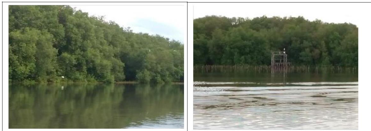
Figure 1. Mangrove ecosystem of LMC

Beside birds, some other fauna can be found such as fishes, crustaceans and amphibians. Some different invertebrates, such as molluscs and arthropods, can be easily found the LMC.