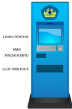
Figure 1. Hardware Kiosk Case Design

Software development follows Rapid Application Development (RAD) method. There are four phase in RAD: user requirements, user design, construction, and cutover.