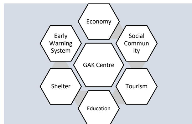
Figure 2 Goal of Disaster Tourism Concept of Mount Anak Krakatoa

Temporary shelters are the first stage in determining the reconstruction of disaster impacts. At this stage, survivors are removed from disaster-affected shelters to temporary shelters. This stage becomes the determining stage of survival of the survivors, where we must be able to meet all their needs. These needs are not merely material aids such as facilities, food, and fabrics. But also sanitation, privacy, recreation and others are required. The construction of disaster emergency shelters is the second stage in the implementation of resilience strategies in the post-disaster period. While the final stage of the implementation is the pre-disaster period through the prevention process [23]. Figure 2 shows the disaster tourism concept of Mount Anak Krakatoa which supports various function of activities, i.e.: shelter, education, economy, early warning system, tourism, and social community.