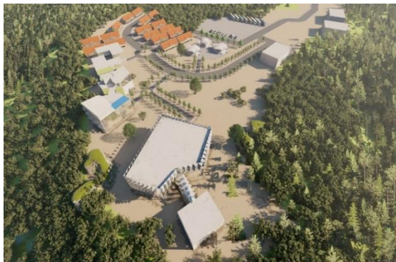
Figure 4 Design of Emergency Shelter in The Coastal Area of South Lampung.