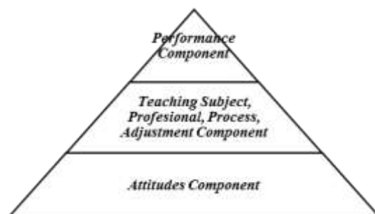
Figure 2. Aspects of Teacher Competency [21]

The above view explains that competence has special characteristics related to the ability to achieve achievement. Meanwhile, to achieve high achievements requires maximum competency that is both physical and mental. Thus, high achievement will be obtained when someone combines their business, competence and skills. In terms of achievement, it is further explained that achievement depends on the right combination of effort, competence and skills. Described the components of teacher competency including; performance, knowledge, skills, processes, self-adjustment, and attitudes, values, and appreciation [20]. Aspects of Teacher Competency can be seen in Figure 2 below.