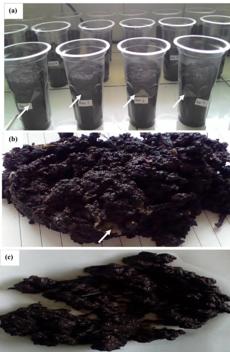
Figure 3. (a). Biodegradable film planted in pots filled with soil, the film sheet is clearly visible; (b). Observation of the biodegradable film test results in the first week still send the film sheets that have not been degraded; (c). Observation of the biodegradable film test results in second week, no film sheets were visible.

Increased peaks in hydroxyl areas occur in biodegradable films compared to waste seaweed pulp material due to the higher solubility of biodegradable film products. A strong band at 930.3\text{ cm}^{-1} indicates the presence of 3,6-anhydro-galactose residue which is the main structure of seaweed which has the ability to form a gel (Pereira et al., 2013). The peaks between 422-600\text{ cm}^{-1} are dyes such as chlorophyll and carotene originally present in native seaweed and then disappear in biodegradable film products (Indriatmoko et al., 2015). The peaks in the amorphous