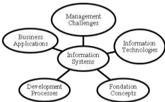
Figure 1. The Components of Information System

and data resources that collect, transform, and distribute information within an organization.