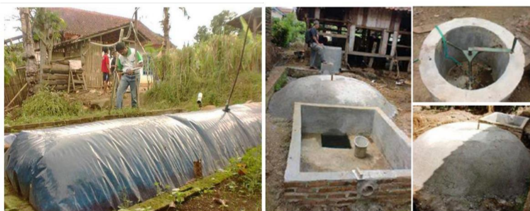
Figure 2. (a) Tubular plastic digester, and (b) fixed dome concrete digester.