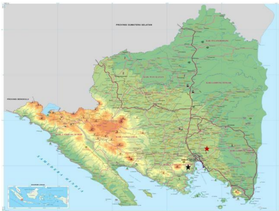
Figure 1. Research locations: Pesawaran Indah (black star) and Marga Lestari (red star).