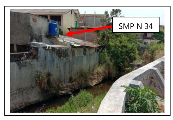
Figure 2. The condition of the river levee behind "SMPN 34" Bandar Lampung

According to Yuneri (2005) stated that the capacity of Way Balau River is only able to accommodate a water discharge of 0.34 m3 / second (13.82%). In contrast, the total discharge in the 5-year return period which reaches 2.64 m3 / second. This means that only 13.82% of the total discharge for the 5-year period can be accommodated by this river, while 86.18% will be the volume of flooding or overflowing water. In line with the data from the study, since it was established in 2016, "SMP Negeri 34" which is located on the tip of the Way Balau River has been hit by major floods twice, in 2017 and in 2019. The impact of the disaster creates various damage to them including important school documents, computer units, and hundreds of book collections in the library. In addition, the floods that occurred also disrupted the teaching and learning process.