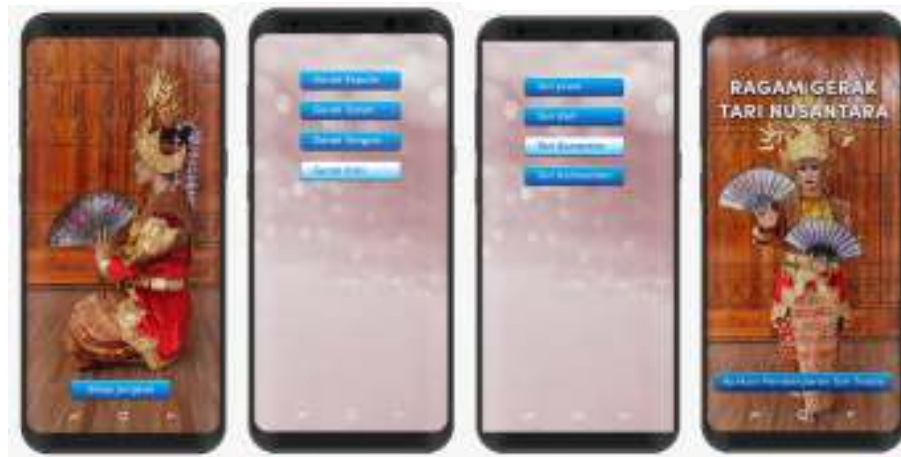
Figure 2. Design of Android-based dance learning application

In Figure 2, the appearance of an Android-based dance learning application, started with the face or cover displaying with the title of the material to be studied, then there is a button that must be pressed that will then display the next slide. There are several choices, namely dance from various regions, and when pressed one of the dances the next page will display gestures then choose which parts to learn. Simple design of Android-based traditional dance motion learning media, then it will be developed.