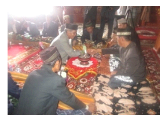
Figure 2b. The usage of Sekapur sirih in customary deliberation (Daryanti, 2018).