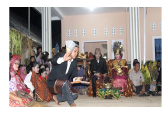
Figure 2a. The usage of sekapur sirih in customary deliberation (Daryanti, 2018).

mainly using Malay customary. Sirih pinang or Sekapur Sirih was used as a traditional means of the wedding ceremony. The use of Sirih pinang was not intended for betel-munching, but only as a customary mean as a symbol. Sirih pinang was used as a symbol that contained meaning for the community as a form of acceptance and respect. Some research on the use of sirih pinang in marriage ceremonies as a symbol of sirih pinang as a means of non-verbal communication in the habit of persuasion and engagement, to gain certainty. Sirih pinang has a deep meaning for society, the use of areca nut in any traditional ceremony, especially on the nyambai event was used as a symbol. Sirih pinang was an instrument of unisex a kinship. The following values are contained in the symbol of areca nut which can be implemented in daily life especially to build character in the young generation.