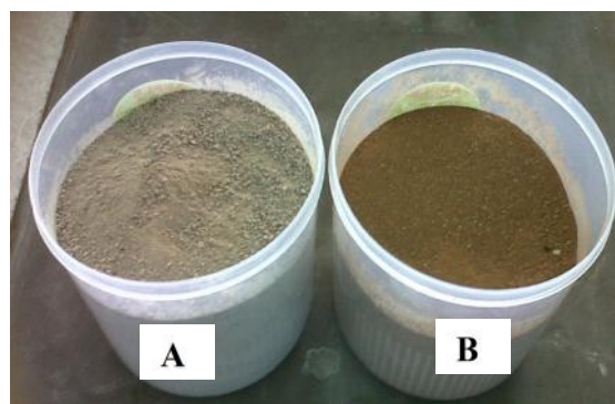
Figure 1. Texture differences between phosphate rock from Selagailingga, Central Lampung (A) and Sukabumi, West Java (B).

i.e. hydrochloric acid (HCl), sulfuric acid (H 2 SO 4 ), and acetic acid (CH 3 COOH) as well as agroindustrial wastewaters of tofu, palm oil, tapioca, and pineapple caning. The second factor was origin of PR i.e. from Sukabumi and Selagai Lingga. Every treatment was incubated by soaking the PR with acid solvent in 0, 1, 2, and 3 month. Every treatment was done by three replications.