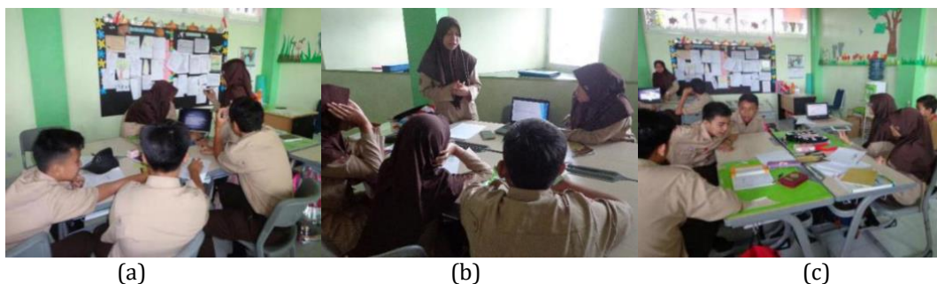
Figure 2. Argumentation Interactive Session in the Experiment Class (a)-(c) Group 2-4

In interactive argumentation session syntax, students carry out group discussions by visiting and receiving guests. The interaction between each group's arguments was recorded in audio form and each question asked from the guest along with the answers given from the presenter group were written. This can be seen in Figure 2 and Figure 3.