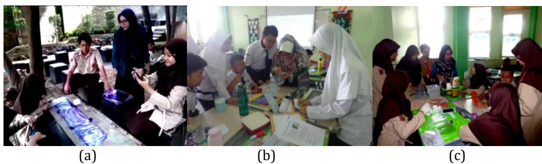
Figure 1. Data Collection Session in the Experiment Group (a) air pollution; (b) water pollution; (c) soil pollution.

In data collection syntax, students carry out investigative activity to collect and analyze data in cooperation. This can be seen in Figure 1.