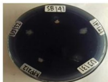
Figure 4. No isolates produced amilase enzyme