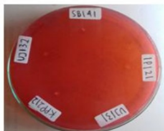
Figure 5. No isolated produced mannanase enzyme.