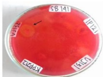
Figure 3. Signs ↙ produce cellulase enzymes