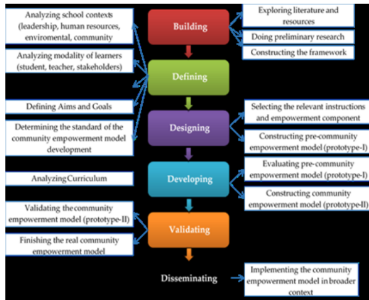
Figure 1. Model development stages 25