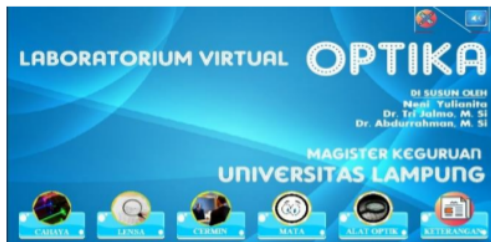
Figure 1. The Title Page and Main Menu of the Virtual Laboratory

The design of the developed virtual laboratory consists of 1) Title Page and 2) Main Menu (Figure 1).