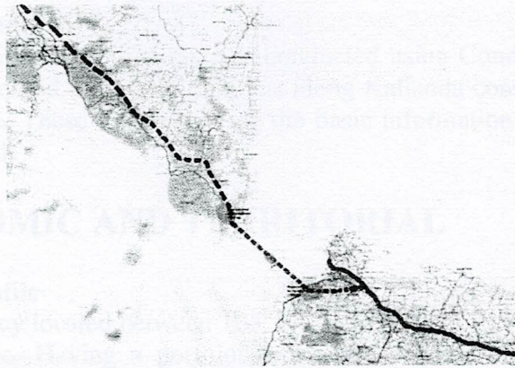
Figure 3. Highway Development Planning