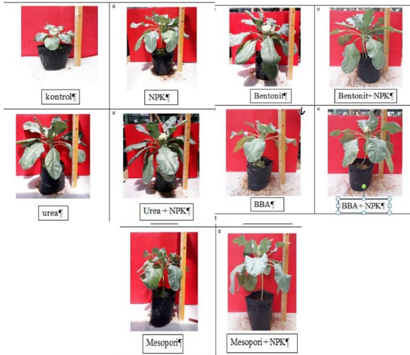
Picture 1. The appearance of plants with types of N fertilizer source and NPK addition