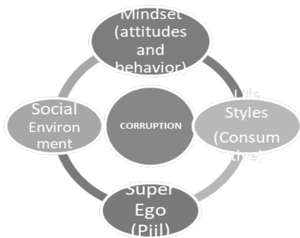
Graphic 3: Sociological Factor of Regional Head Corruption in Lampung Province

The organizational circumstances can also influence someone to corrupt. We see that anyone can be involved in corruption, both superiors and subordinates. If a leader does not have exemplary and integrity, this can be imitated by his subordinates. Corruption in Lampung is an interesting phenomenon because several regional heads have been caught doing corruption through OTT by the KPK. This corruption is not only created by corporations and DPRD members, but also by bureaucracy. We can see in graphic 3.