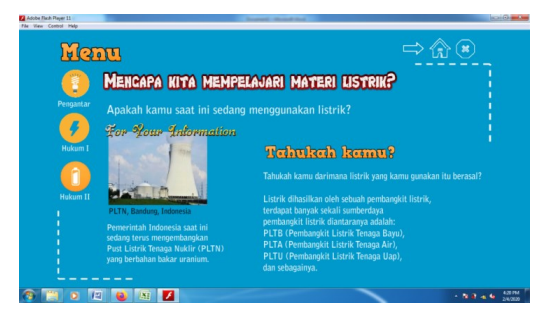
Figure 3. Display of Material

The validity and practicality of interactive multimedia can be seen in Table 1- Table 3.