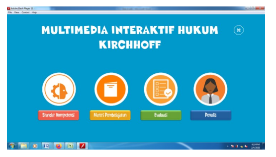
Figure 2. Initial Display of Interactive Multimedia Products

gins with a pretest to determine students' initial abilities. Then students are asked to explore the material through interactive multimedia. At the end of knowledge, students are given a posttest to see the effect of interactive multimedia in improving student learning outcomes. There are ten questions in the pretest and posttest.