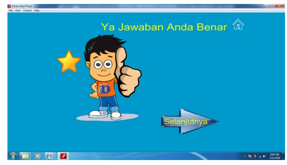
Figure 5. Feedback when students answer the questions correctly

Achievement of the effectiveness of interactive multimedia seen from the mastery of students in the cognitive aspects of students is determined based on a comparison between student learning outcomes. Besides, the learning process with interactive multimedia is doing with the learning cycle learning model. There are seven stages in the learning cycle learning model, namely: elicit (bring students' fundamental knowledge), engage (generate interest), explore (explore), explain (explain), elaborate (implement), evaluate (evaluate), and extend (expand). Interactive multimedia is using in the explore (explore) stage, at this stage, students are asked to understand and explore Kirchhoff's law material through Kirchhoff's law learning media. The learning media provided include material that is explained from simple to complex, concrete to abstract. It is also equipped with sample problems, illustrations, and evaluations so that students more easily understand the material presented. Brunner said children understand and remember concepts better when they discover ideas done by themselves through exploration (Roblyer & Doering, 2010: 36). Students construct their knowledge to build