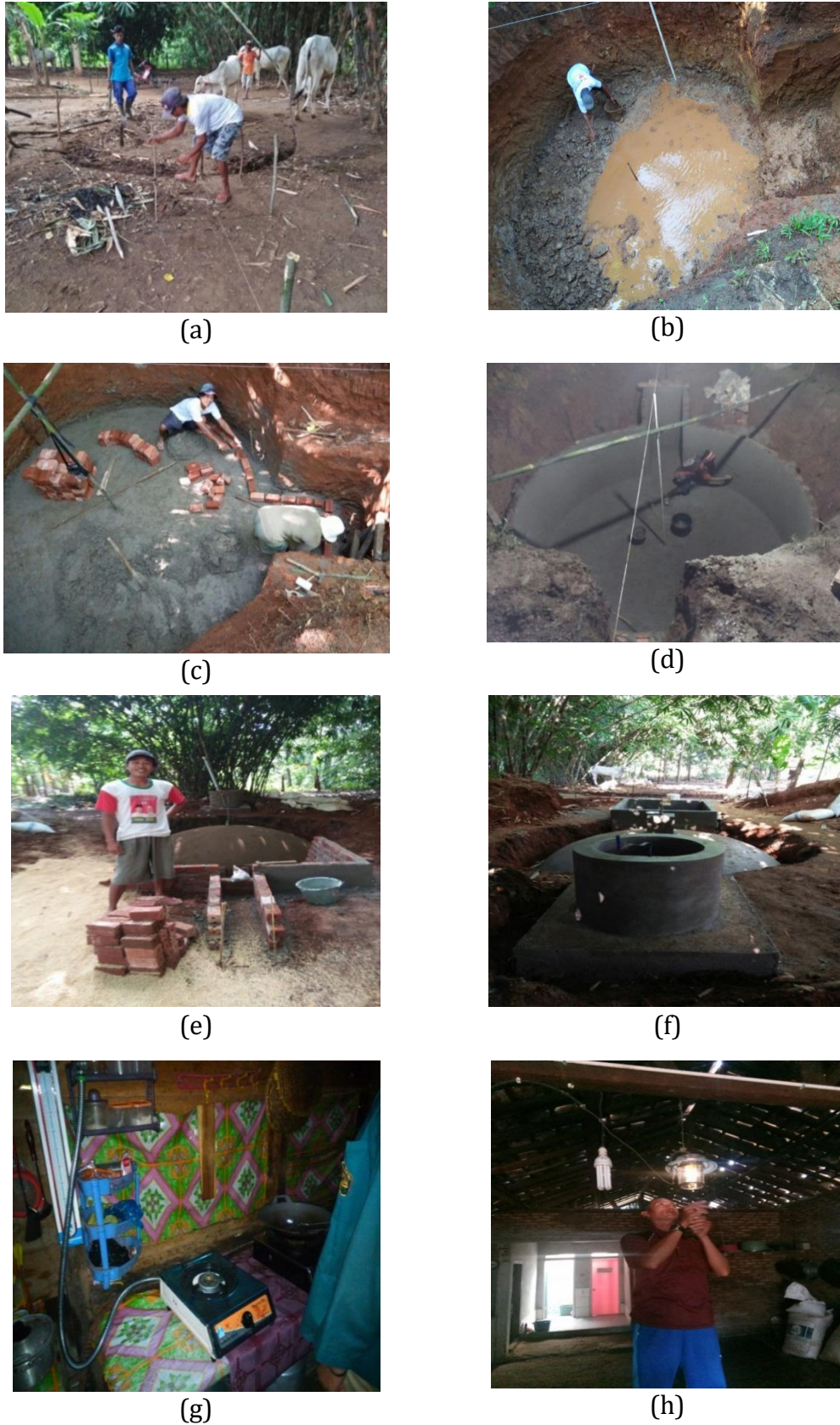
Fig. 2 (a); (b); (c); (d); (e); (f); (g); and (h) Construction of a biogas digester and installation of biogas stoves and biogas lamps