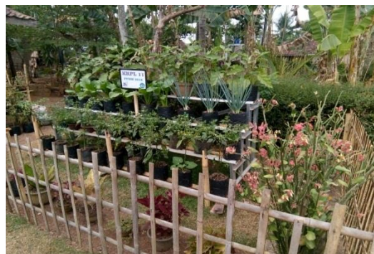
Fig. 4 Sustainable food home area

At present, the people of Kediri Village have turned their yards into sustainable food home areas that aim to meet the needs of their families for healthful vegetables and fruits. These vegetables and fruits can be obtained because the fertilizer used is bioslurry organic fertilizer, which is the output of the digester. If the harvest from the yard is more than what a family needs, then the rest is sold. Proceeds from sales can marginally supplement a family's income, providing an average additional income of around IDR 300,000/month. The minimal use of bioslurry can generate a small amount of additional income. If bioslurry is processed commercially on a large scale, then this option becomes economically attractive.