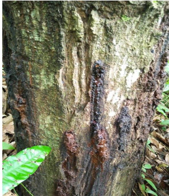
Figure 2. Tree trunk damage in the form of resinosis.

Figure 2 shows one of the damages that occur in trees, namely resinosis. This damage was initially caused by cancer in the tree trunk which is marked by the presence of a swollen trunk and a dark black color. Then the cancer causes resinosis which is characterized by a clear or brown discharge (Pracaya, 2008).