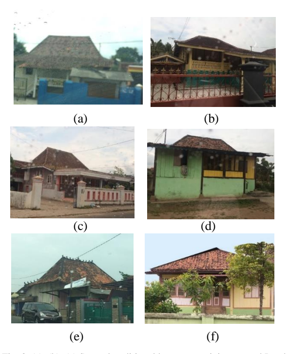
Fig. 3. (a), (b), (c) Several traditional houses remaining around Lamban Balak. (d), (e), (f) Some traditional houses are still left and modified (around Dr Setia Budi street) Kuripan sub-district, South Side of Lamban Balak .

There is no open space (square) in this area, except open space in the form of public cemetery area. Open space typologies [10], have been replaced by linear open space in front of the building/sluggish as a multifunctional (communal) space when there are events/ceremonies/ traditional ceremonies. This condition will certainly be contradictory to the current conditions, where the linear open space in front of Lamban has become a public open space for the circulation path of vehicles and accessibility to other areas. In terms of green layout, there is no crop arrangement