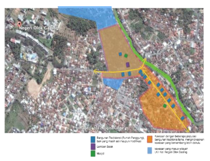
Fig. 1. The existing traditional building distribution patterns.

Hypothetical pattern of village setting in Negeri Olok Gading refers to the explanation above. In the diagram below, it can be explained that Lamban Balak Negeri Olok Gading is located on the East side adjacent to the river. While on the west side there is a tomb meaning to indicate that the typology of the settlement is identical or similar to what was