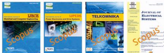
International Journal of Electrical and Computer Engineering International Journal of Power Electronics and Drive Systems TELKOMNIKA Telecommunication Computing Electronics and Control Journal of Electrical Systems

All accepted, registered and presented papers will be submitted to IEEE Xplore® Digital Library. All uploaded papers in IEEE Xplore will be normally indexed in Scopus database. The excellent accepted papers after extension and modification will be published in SCOPUS indexed journals (additional charge applies):