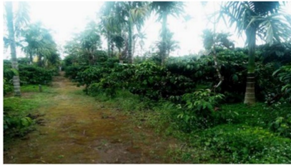
Figure 7. Intercropping principle at target plantation.

Target plantations were cultivated by using of the intercropping principle; an Areca palm ( Areca catechu L.) specie was grown there as an intercrop intended to protect coffee trees against to abundance of sunshine and prevent of the water vaporization [32], see figure 7.