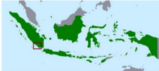
Figure 2. Target area of collection.

Samples were collected during the rainy season in February 2019 at organic shaded coffee plantations placed in mountain areas of Hanakau city, Sukau district, West Lampung Regency, South Sumatra, Republic of Indonesia, as expressed in figure 2.