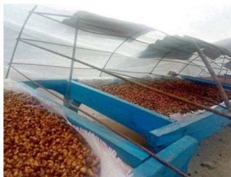
Figure 6. Postharvest treatment equipment: solar sun dryer.