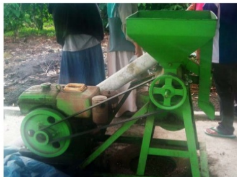
Figure 5. Postharvest treatment equipment: pulping machine.

Collected CP samples were removed from the raw coffee cherries by using of pulping machine (see figure. 5) directly after harvest and CH samples were collected after the process of green coffee beans natural sun drying (see figure. 6) and removing of skin remains. Thus, CP samples occurred in their initial moisture content, while CH samples were already sundried during drying process.