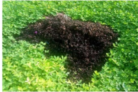
Figure 4. Investigated samples: fruit waste biomass.

Collected CP samples were removed from the raw coffee cherries by using of pulping machine (see figure. 5) directly after harvest and CH samples were collected after the process of green coffee beans natural sun drying (see figure. 6) and removing of skin remains. Thus, CP samples occurred in their initial moisture content, while CH samples were already sundried during drying process.