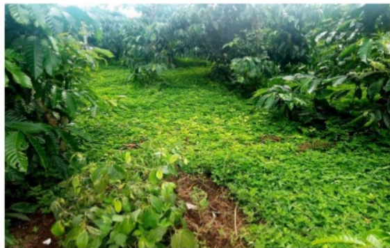
Figure 8. Cover crops principle at target plantation.