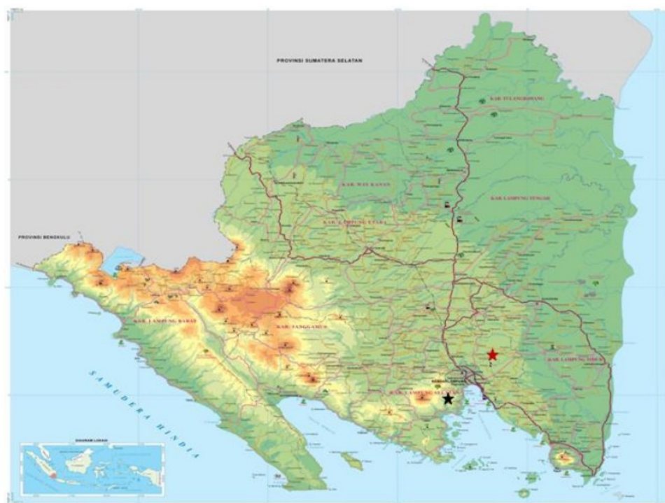
Figure 1. Research locations: Pesawaran Indah (black star) and Marga Lestari (red star).