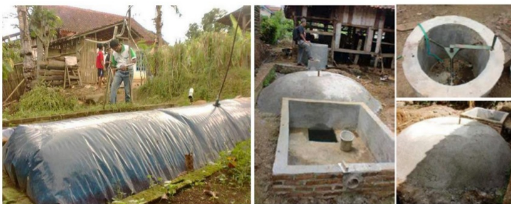
Figure 2. (a) Tubular plastic digester, and (b) fixed dome concrete digester.