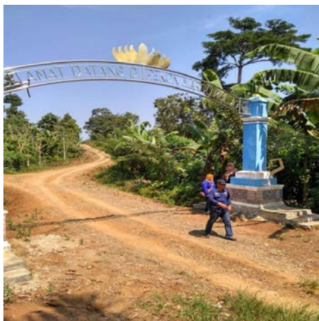
Fig.1. It explains that researchers were in the forest buffer zone of TNBBS. On the right side of the road, it shows that there is no wall, barbed wire, or others as the security. Someone might enter freely in the area of TNBBS (research observation on 24 July 2017).

Furthermore, informant 1 explained that the cause of land opening in TNBBS: “moving from the village because there was no land, and seeing the area, so I followed them. Seeing there is a house in the forest, so I was also caught by forest ranger. Following, and because following the parents since young (who also opened the land in the area of national park). So, people are free to open.” (Interview on 15 November 2016).