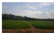
Figure 5. Paddy field of a tenant in state forest area