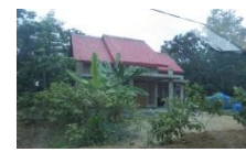
Figure 6. A house and yard of a tenant in state forest area.