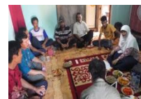
Figure 4. Meeting between the tenants to discuss state forest management