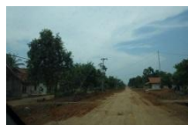
Figure 3. Amenities road and electricity network built by the government of South Lampung district.