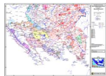
Figure 2. Map of partly of KPH in Lampung Province.