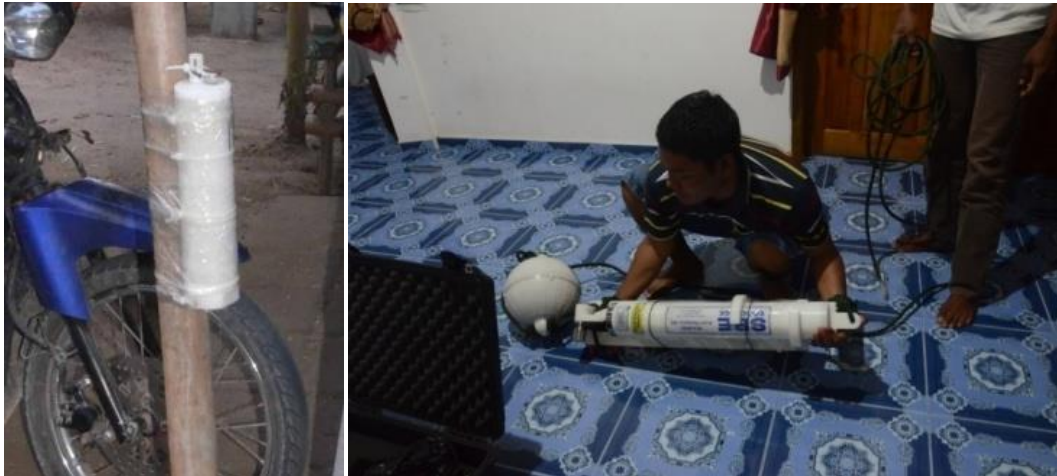
Figure 1. RBRDUO TD (left), SBE 26 (right)