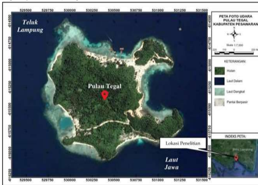
Figure 1. Map of Aerial Photos of Tegal Island

Geographically the island is located at coordinates 05 ° 34 '00 "LS and 105 ° 16 '29" BT (Oriana, Nindita, Isni Nurruhwati, Indah Riyantini, 2017).