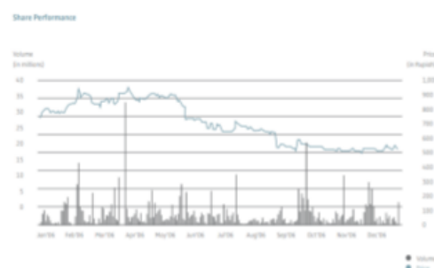
Figure 2 Share Performance PT. Energi Mega