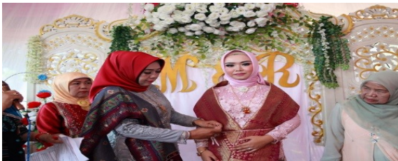
Figure 4. Attachment of Jung Syarat Cloth and Seven-Color Ropes (Ariyani, 2019)

After putting on the necklace, it is continued with the attachment of Jung Syarat cloth and Seven-Color Ropes as shown in Figure 4. The Jung Syarat cloth is attached by the bridegroom's mother as a sign that the bride has been tied or already belonging to the bridegroom. Tying a diamond string to the bride's waist which consists of 7 (seven) colors in which, according to the Lampung Elders' beliefs, has the meaning of being married and keeping away from all obstacles until the wedding procession later.