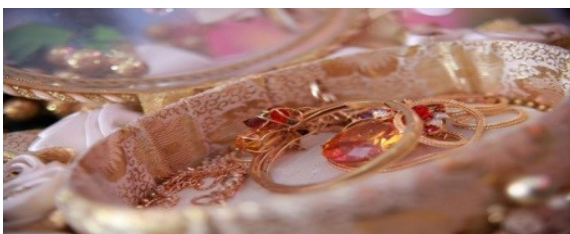
Figure 1. Jewelry (necklaces, rings and bracelets) (Ariyani, 2019)

The various wedding items brought along when nyirok have a certain meaning to a man's responsibility. Later he, the husband, will meet all the needs of his wife and family. In addition to basic needs, giving the bride the wedding items is also a symbol of seriousness of the bridegroom to love and be loyal to the bride. As for the items brought along during the nyirok procession, among them are a set of prayer tools and jewelry. The former is an obligatory wedding item for Muslims that is a symbol that religion is the main foundation, while the latter has the meaning that a woman as a prospective wife always shines and sparkles throughout her life (Figure 1).