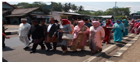
Figure 2. Welcoming of the Groom's Flock (Ariyani, 2019)

The procedure for nyirok procession begins with the reception for the bridegroom (Figure 2). The bridegroom comes with his flock, accompanied by oral literature called pisaan in which there are hopes and prayers (see Table 1). Then it is continued with breaking the needle on either side of the door, which aims to break all that is not good at this door and hopefully the sharp ones become blunt, the bad ones become good. Before stepping into the door of the house, first of all the right leg is lifted up which is then drenched with water that has been provided, with the hope that the married life is always cool and serene.