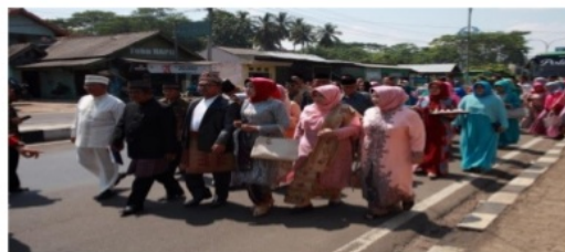
Figure 2. Welcoming of the Groom's Flock (Ariyani, 2019)

The procedure for nyirok procession begins with the reception for the bridegroom (Figure 2). The bridegroom comes with his flock, accompanied by oral literature called pisaan in which there are hopes and prayers (see Table 1). Then it is continued with breaking the needle on either side of the door, which aims to break all that is not good at this door and hopefully the sharp ones become blunt, the bad ones become good. Before stepping into the door of the house, first of all the right leg is lifted up which is then drenched with water that has been provided, with the hope that the married life is always cool and serene.