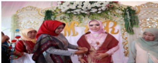
Figure 4. Attachment of Jung Syarat Cloth and Seven-Color Ropes (Ariyani, 2019)

After putting on the necklace, it is continued with the attachment of Jung Syarat cloth and Seven-Color Ropes as shown in Figure 4. The Jung Syarat cloth is attached by the bridegroom's mother as a sign that the bride has been tied or already belonging to the bridegroom. Tying a diamond string to the bride's waist which consists of 7 (seven) colors in which, according to the Lampung Elders' beliefs, has the meaning of being married and keeping away from all obstacles until the wedding procession later.