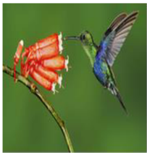
Figure 3. Picture on the left shows a hummingbird flapping its wings while sucking on nectar. Hummingbirds have a body mass of about two grams. This bird flaps its wing 80 times every second. Why does the hummingbird flap its wings? What do you think about it?

Based on the analysis, it could be said that the test instrument of critical and creative thinking ability was designed to build and train students' critical and creative thinking skills based on the indicators of problem made. The following are examples of problems that could improve students' critical and creative thinking skills in simple harmonic motion materials.