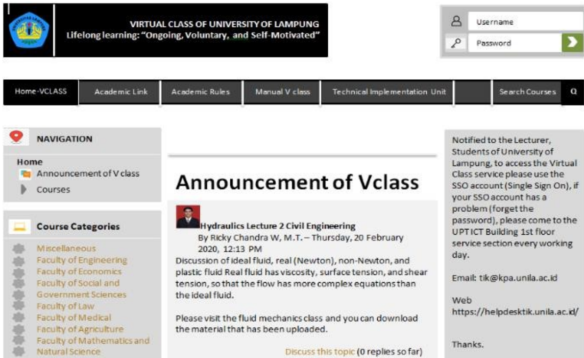
Figure 3. Home Look of Virtual Class of University of Lampung

The display of virtual class and Edusmart in University of Lampung to be combined in blended learning as the home look can be seen on figure 3 and 4 below.